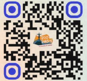
QV Highlights Video

In a word: awesome! It is a mix of prayer, competition, worship, fraternity, sports and games, and music. Scan or click the QR code for the 2025 Quo Vadis highlights video and get a glimpse at last year’s camp!